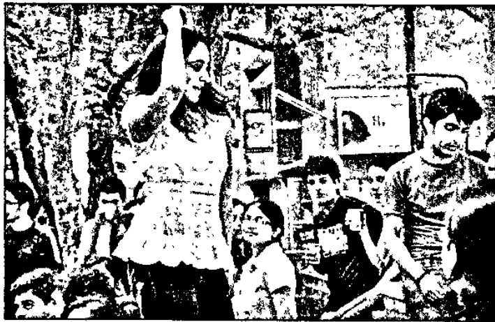
Uttar Pradesh is the top offender with 355 complaints since 2009. Delhi, surprisingly, recorded only one complaint

In July this year, the government's anti-ragging campaign underwent a few changes. The UGC appointed the Aman Satya Kachroo Trust to monitor the programme for a year. It also began a website — antiragging.in — in collaboration with